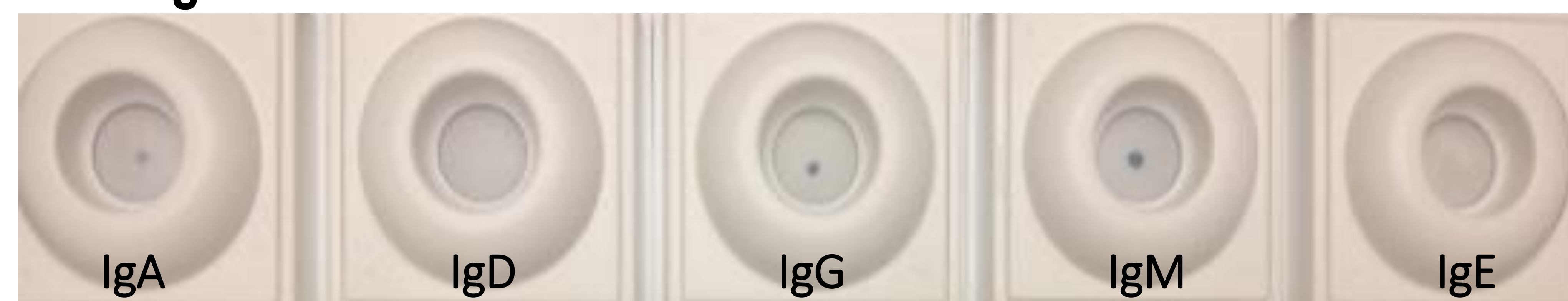
Figure 3: INSTI protein-A/indigo solution produces visible reactions to human IgA, IgG, IgM, but not to IgD, IgE.