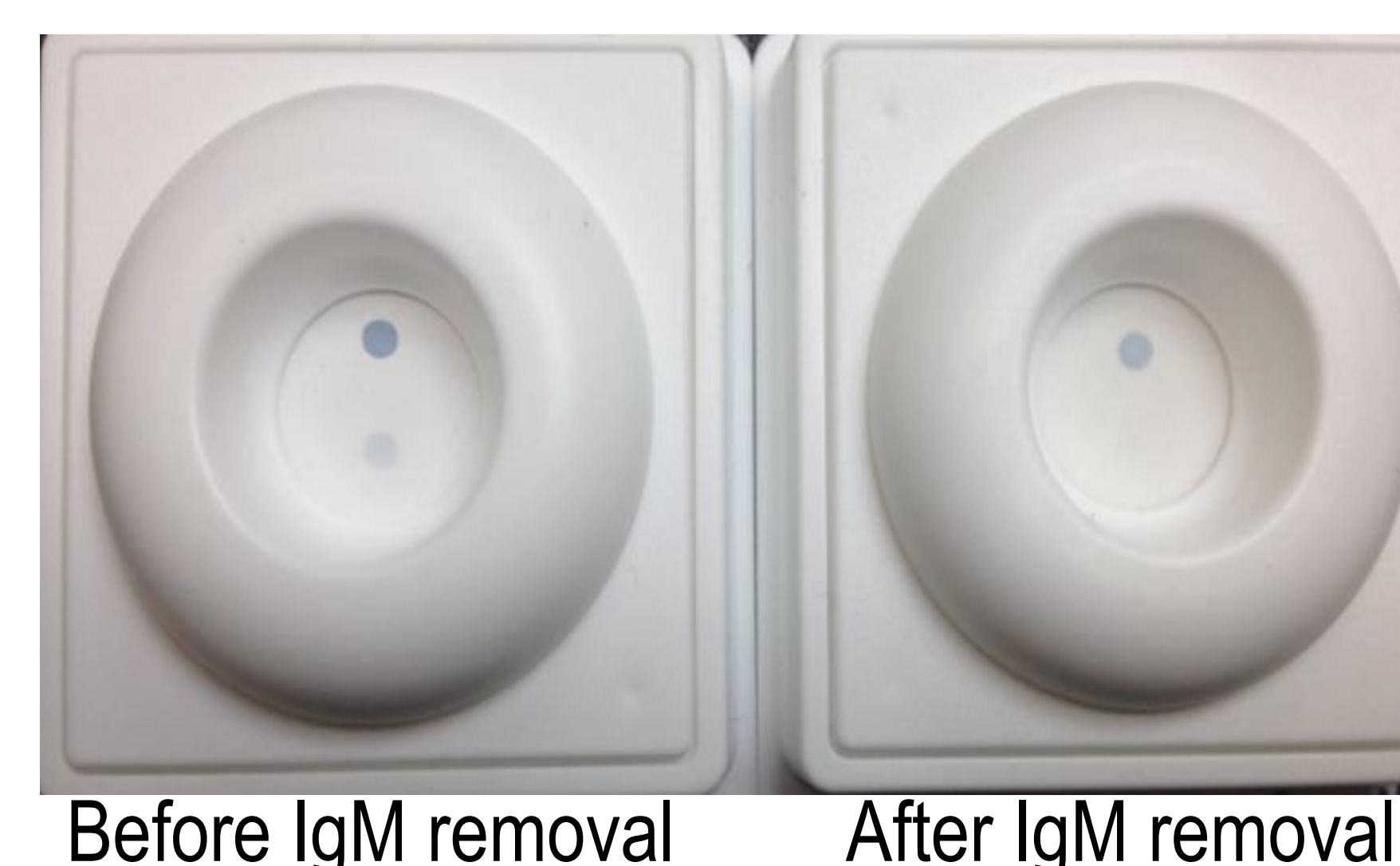
Figure 4: A 100% reduction in INSTI intensity is interpreted as non-reactive. P: Positive; N: Negative; IND: Indeterminate; ND: in-house IgM assay not determined; *: meets Fiebig class III staging definition.